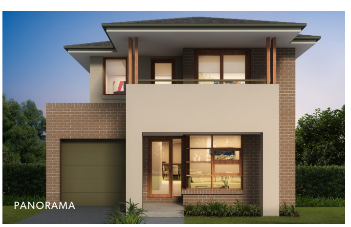
Photographs and artist impressions are indicative only. They may include upgraded features above the standard inclusions such as, but not limited to; feature render, feature tiling, stack stone, landscaping, floor finishes, window furnishings, furniture, light filtings and decor items. Please refer to the standard inclusions for details or speak with a New South Homes Part 1 to Rivillars License Number: 319502C