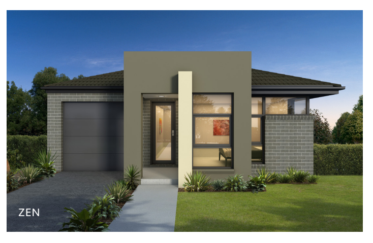
Photographs and artist impressions are indicative only. They may include upgraded features above the standard inclusions such as, but not limited to; feature render, feature tiling, stack stone, landscaping, floor finishes, window furnishings, furniture, light filtings and decor items. Please refer to the standard inclusions for details or speak with a New South Homes Part 1 to Rivillars License Number: 319502C