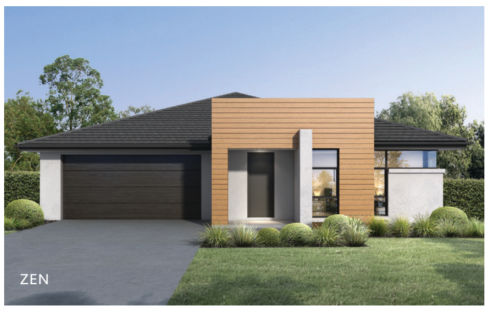
Photographs and artist impressions are indicative only. They may include upgraded features above the standard inclusions such as, but not limited to; feature render, feature tiling, stack stone landscaping floor finishes, window furnishings, furniture, light fittings and decor items. Please refer to the standard inclusions for details or speak with a New South Homes Ptv. Ltd Ruiklers License Number: 319502C